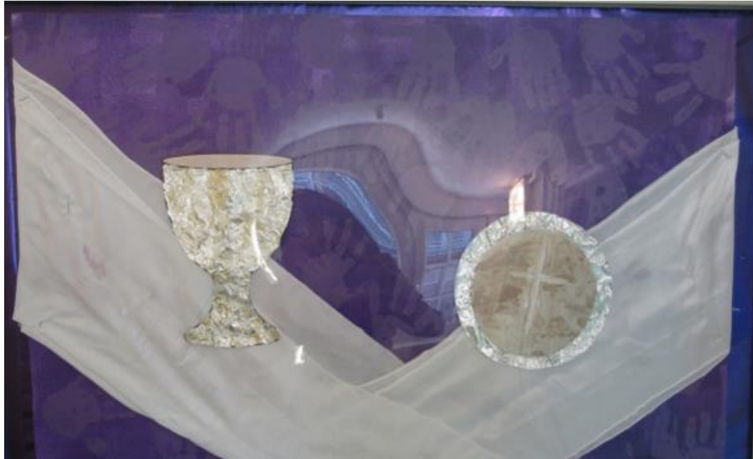
Image from Our Lady of Dolours Primary, Westminster